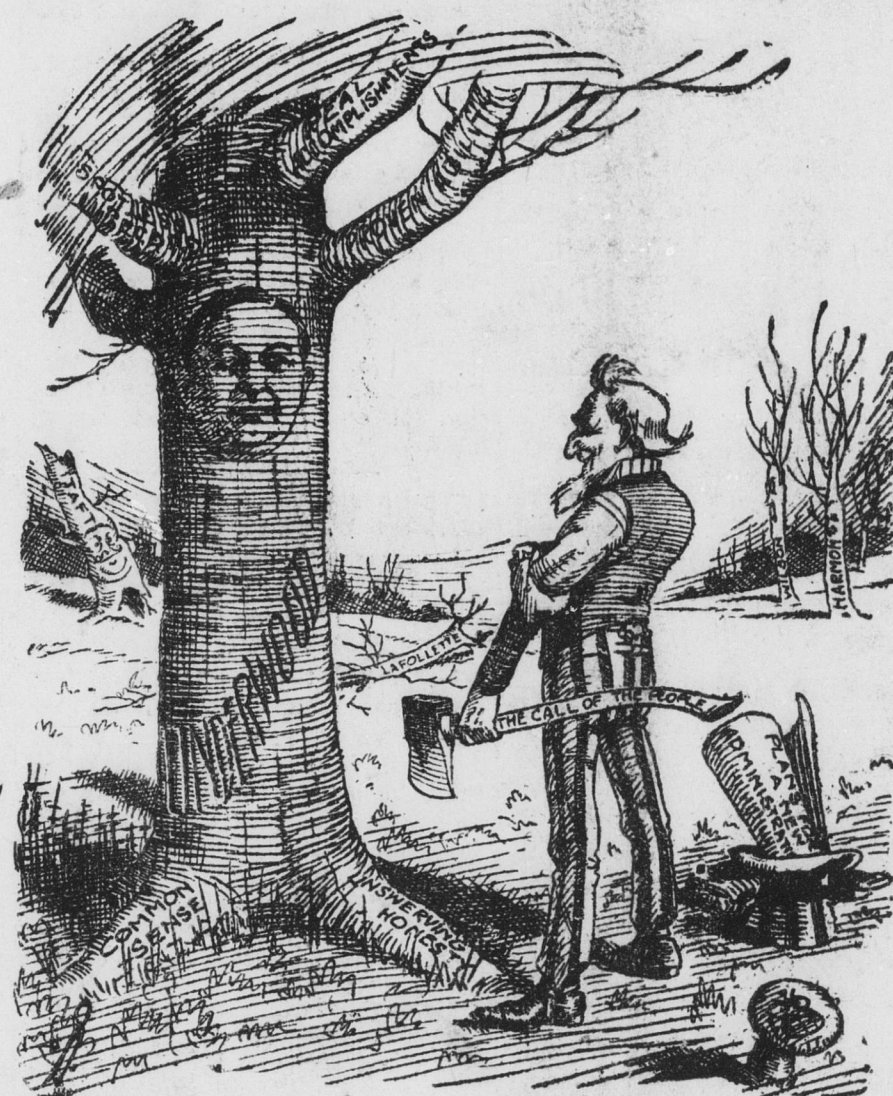
UNCLE SAM: "This Tree Strikes Me as Mighty Fine Presidential Timber."

Should it prove that other liners, notably the Allen Liner's Parisian and Virginia, known to have been in the vicinity of the Titanic early yesterday, had picked up other of her passengers, the extent of the calamity would be greatly reduced. This hope still remains.